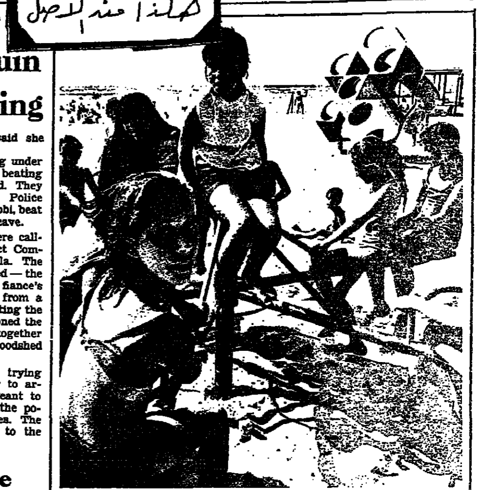
CLEAN BEACH. — Tel Avivians will be able to enjoy one uncontaminated beach — officially — as of July 23. Jaffa's Givat Aliya beach, which will be opened to the public on that date...

TEL AVIV. — A driver who ran over and killed a man walking in a funeral procession was sentenced by the Magistrate's Court here Wednesday to a six-month suspended jail sentence, fined IL2,500 and had his license revoked for three months.